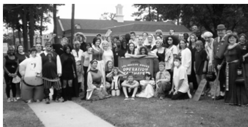
All volunteers from Operation Safe Haven 2009 take a moment to say "Cheese!"

Operation Safe Haven relies on the support of local companies who donate money, prizes, and time volunteering at the event. This year, the Salem High School